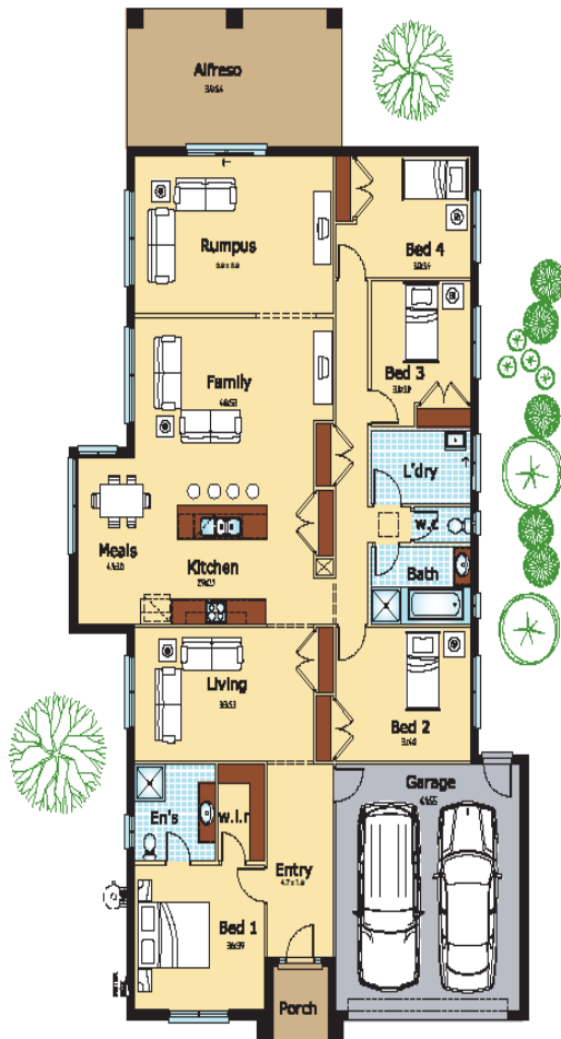
Cambridge 29 Series 2

Length: 25.5m Width: 13.7m Total area: 289.9sqm 29.0sq's